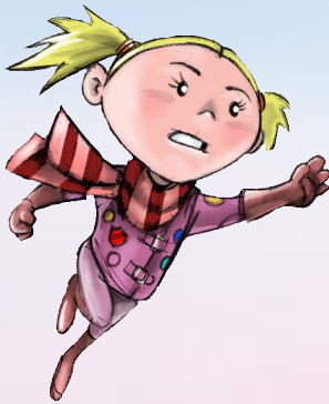
Player character: girl.