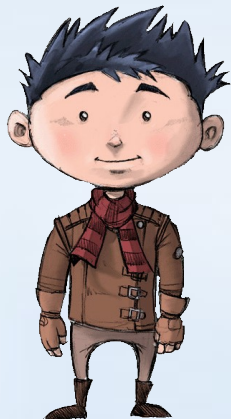
Player character: boy.